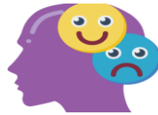
Psychological / Emotional